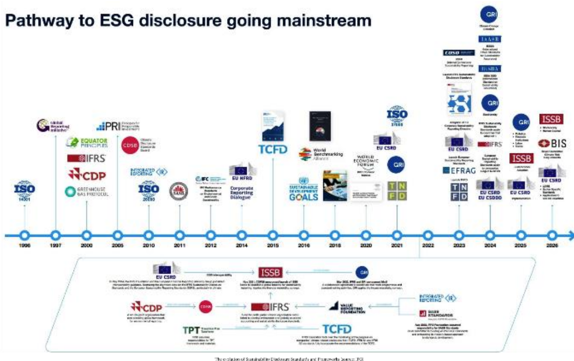
Figure 2: The evolution of Sustainability Disclosure Standards and Frameworks

In 2023 the International Finance Corporation (IFC) created a comparison table (IFC, 2023) comparing different standards and frameworks, which was useful to easily identify the different materiality types, the focus of the regulation / framework and its geographical coverage. The table compared the ESRS - the core component of the CSRD - to prominent regulations and frameworks. In Table 1, we have extended this to include the TNFD, which is currently a voluntary framework, and accommodates both double materiality and financial materiality only. However, the International Sustainability Standards Board (ISSB) is currently investigating disclosure related to risks and opportunities associated with nature and human capital, which includes relevant aspects of the TNFD (IFRS, 2024) Like the Taskforce on Climate-Related Financial Disclosures (TCFD), the TNFD could therefore be merged into the ISSB at a future date. This comparison table is relevant as the International Federation of Accountants